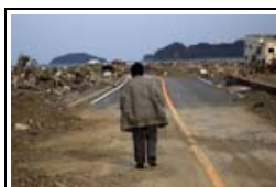
Village vanishes after tsunami