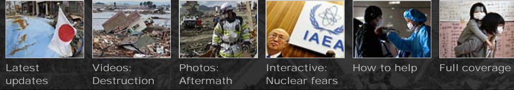
Latest updates Videos: Destruction Photos: Aftermath Interactive: Nuclear fears How to help Full coverage