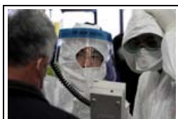
Fears at Japanese nuclear plant