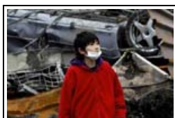
Millions without food, water, power in Japan