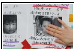
Japan's evacuation centers